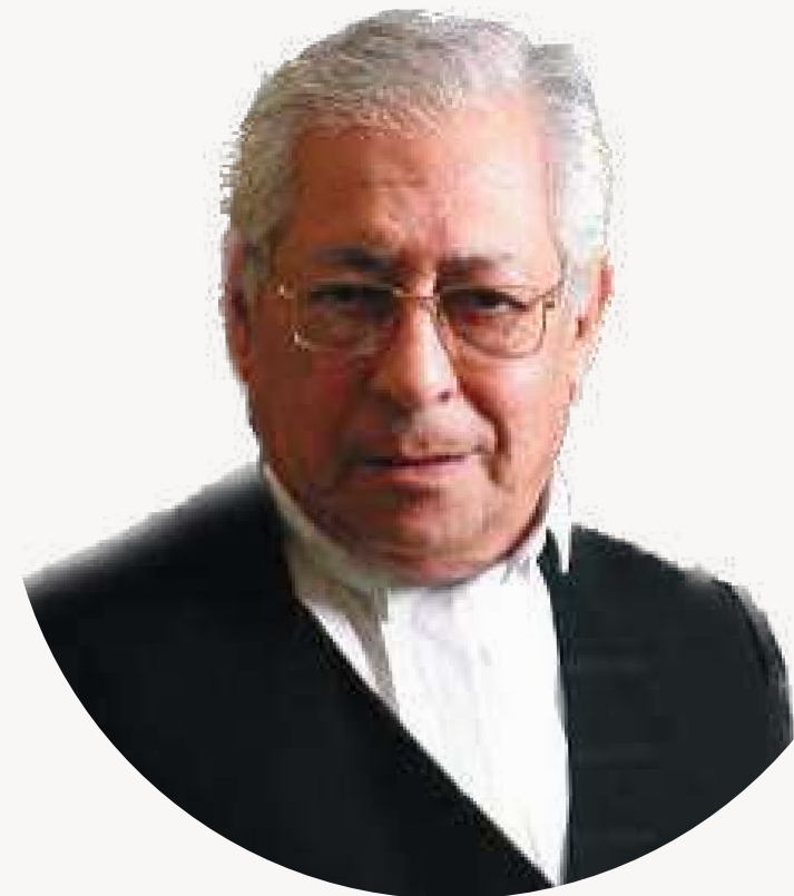
LATE SHRI SOLI J. SORABJEE

Senior Advocate & Fmr Chairman Bar Council of India