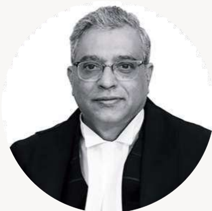
HMJ P.S. NARASIMHA