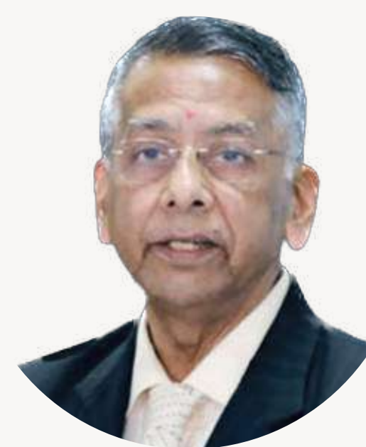
MR R. VENKATARAMANI Ld. Attorney General for India