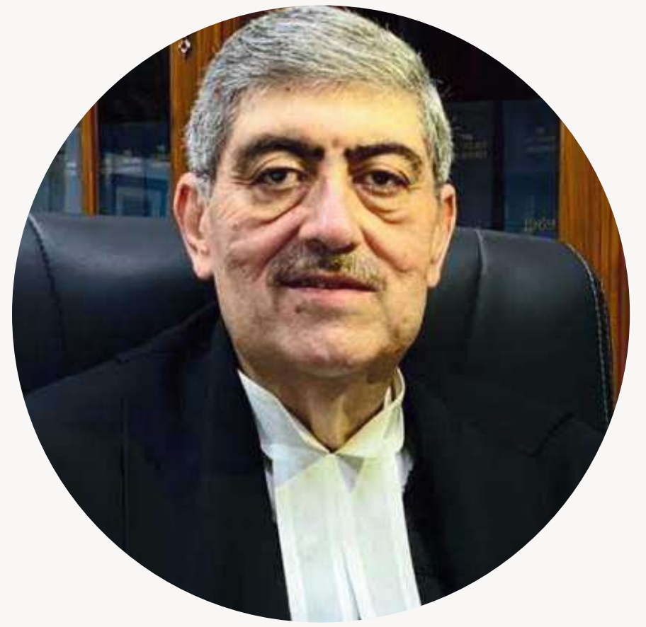
HMJ SANJAY KISHAN KAUL

Hon'ble Home Minister & Minister of Cooperation, Government of India