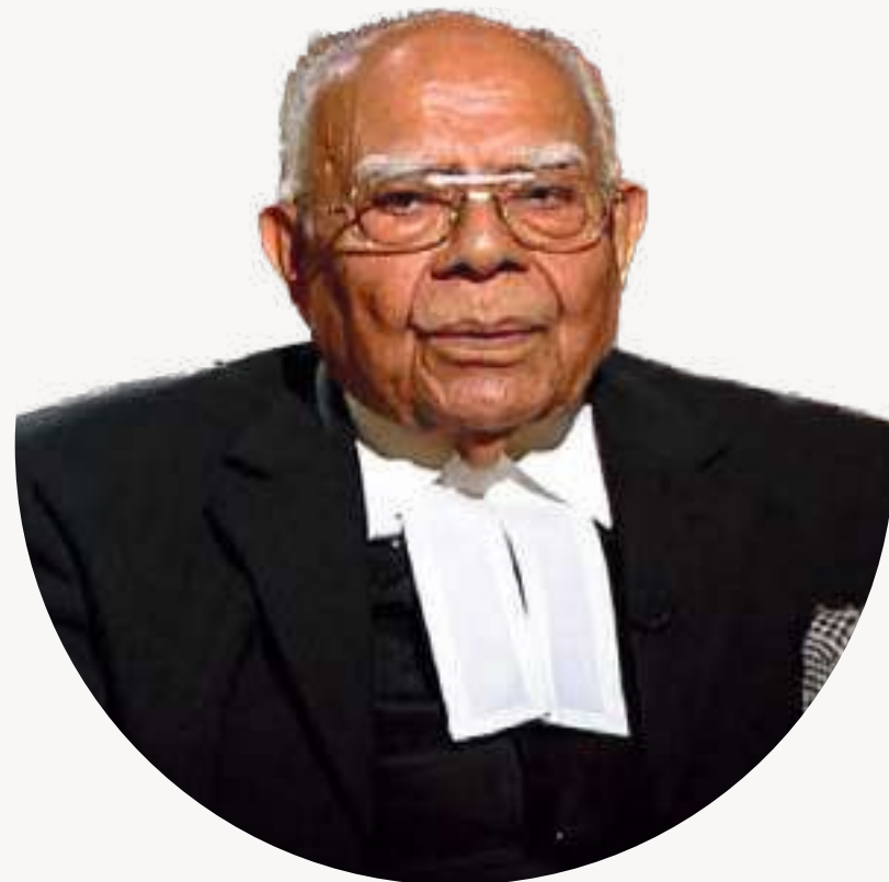
LATE SHRI RAM JETHMALANI

Senior Advocate & Fmr Chairman Bar Council of India