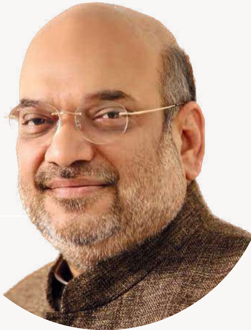
SHRI AMIT SHAH

Hon'ble Union Labour & Employment and Environment, Forest & Climate Change Minister