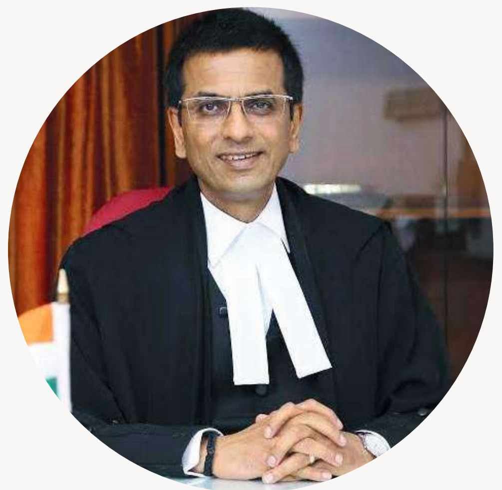
HON'BLE DR. JUSTICE D.Y. CHANDRACHUD Hon'ble The Chief Justice of India as Chief Guest