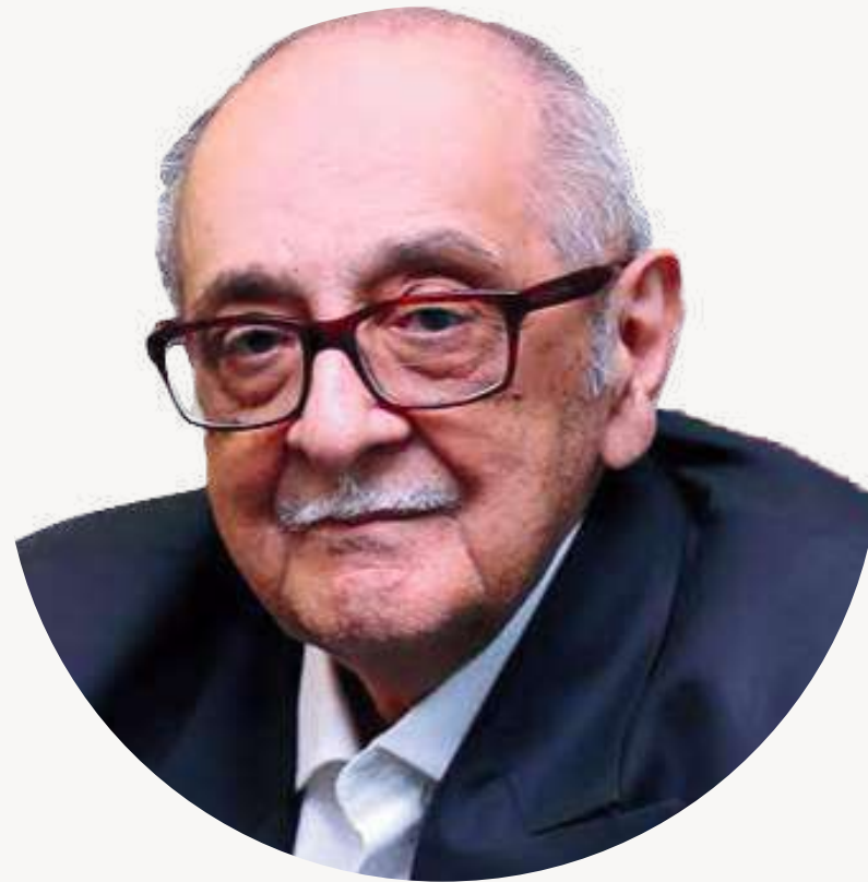
SHRI FALI S. NARIMAN

Senior Advocate & Former Attorney General for India