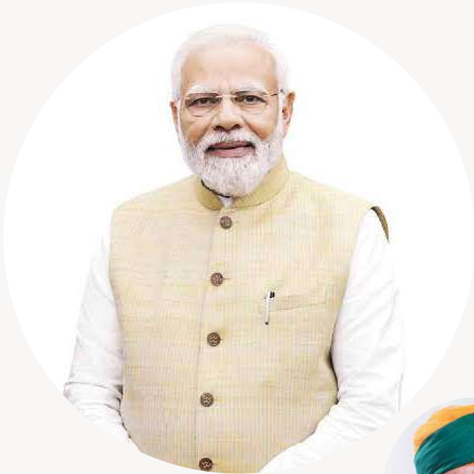
SHRI NARENDRA MODI Hon'ble Prime Minister of India will inaugurate