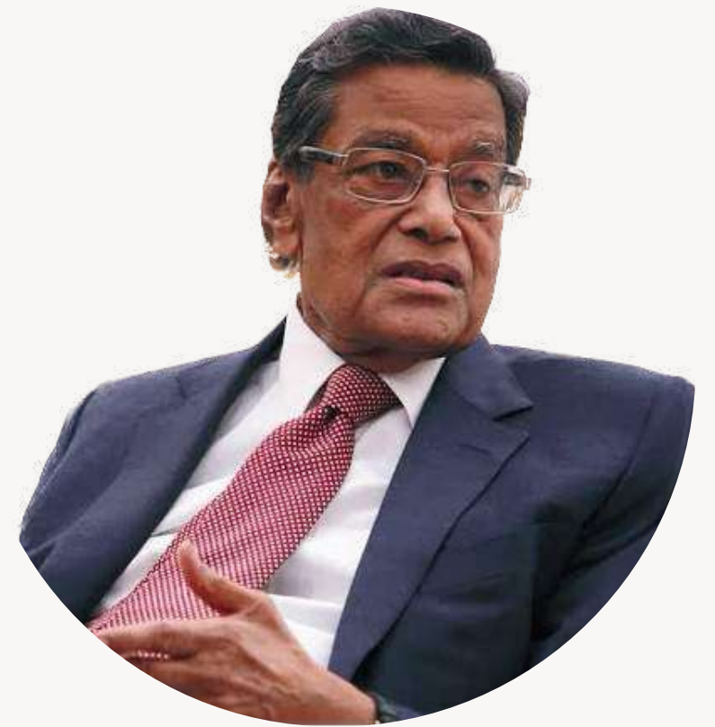
SHRI K.K. VENUGOPAL

Senior Advocate & Former Attorney General for India