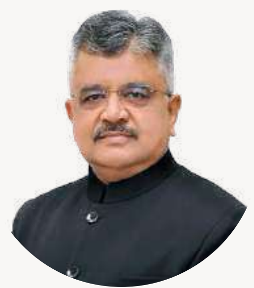
MR TUSHAR MEHTA Ld. Solicitor General of India