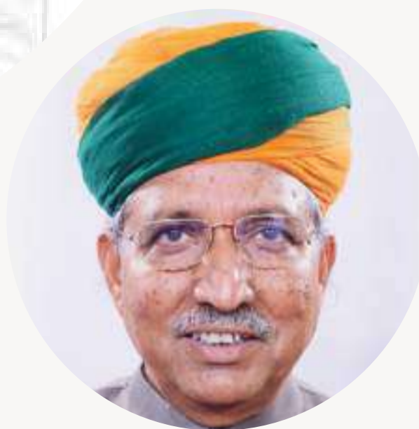
SHRI ARJUN RAM MEGHWAL Hon'ble Union Minister (I/C) for Law & Justice as Guest of Honour