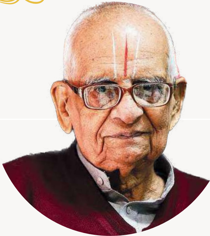
SHRI K. PARASARAN

Senior Advocate & Former Attorney General for India