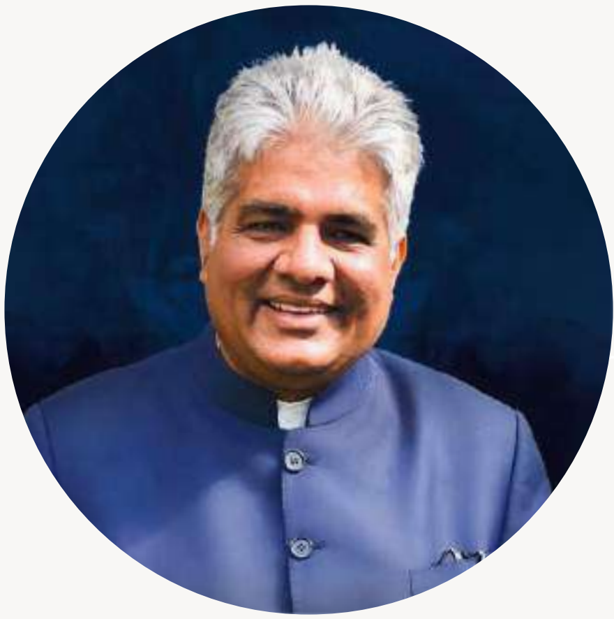
SHRI BHUPENDER YADAV

24.09.2023 | 02:00 TO 03:30 PM | VIGYAN BHAWAN, NEW DELHI