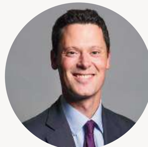
MR ALEX CHALK KC MP Lord Chancellor and Secretary of State for Justice U.K. as Guest of Honour